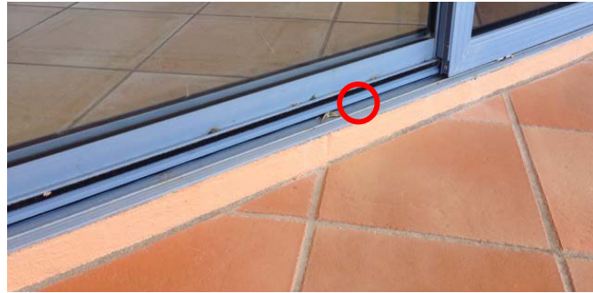
(b) Sliding glass doors with baffle that concealed the weepholes on an apartment balcony