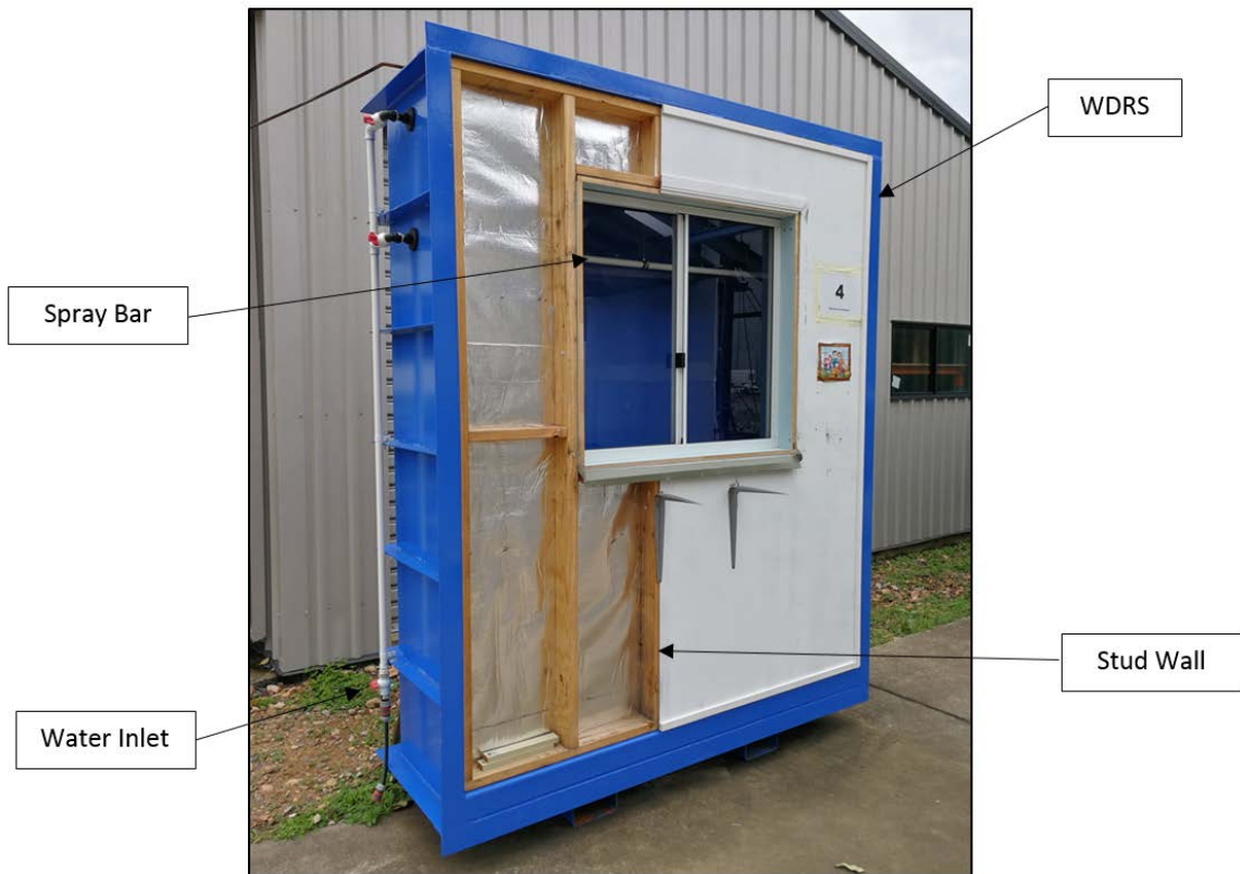
Figure 5: WDRS with Wall and Window Test Sample