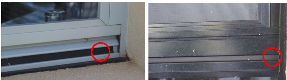
(a) Sliding windows with rubber flaps over weepholes

However some people mentioned, who were in either apartments or houses, they had no water or only a small amount of water enter through their sliding windows during TC Debbie. Typically, the windows without significant water ingress had weep holes that were covered by external rubber strips. Figure 3 (a) shows a window from a house and another in a larger apartment building with rubber seals over the weepholes that performed well. The windows and glass sliding doors in another apartment building, Figure 3 (b), had an external baffle that concealed the weepholes; only a small amount of water leaked through them. This door also had a step that would have assisted in reducing water into the unit from water that pooled on the balcony near the bottom of the door.