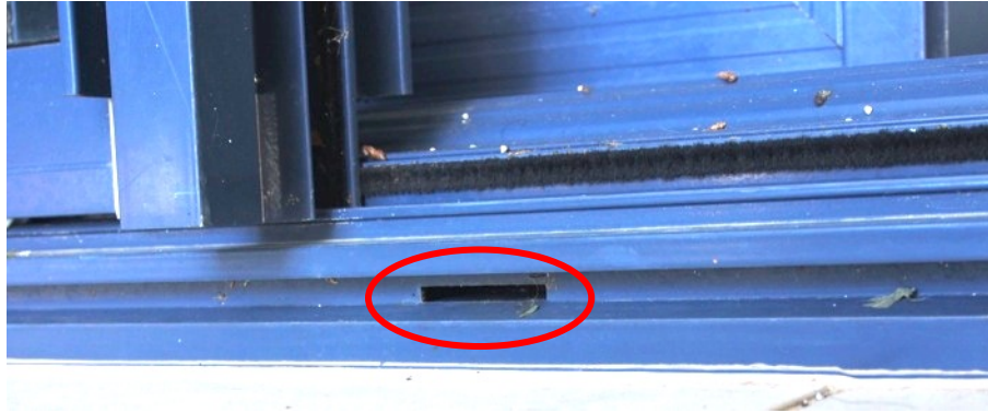
Figure 3 Weephole in glass sliding door frame

Weep holes in windows or glass sliding doors (Figure 3) are designed to allow condensation and minor leakage around seals to pass from the inside to the outside of the building. However, in high winds, differential pressure forces horizontally driven rain on windward walls through weep holes (i.e. in the opposite direction intended in design) and through other gaps in the building envelope.